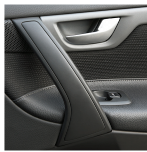
Water-Blown Pour-in-Place Foam Systems